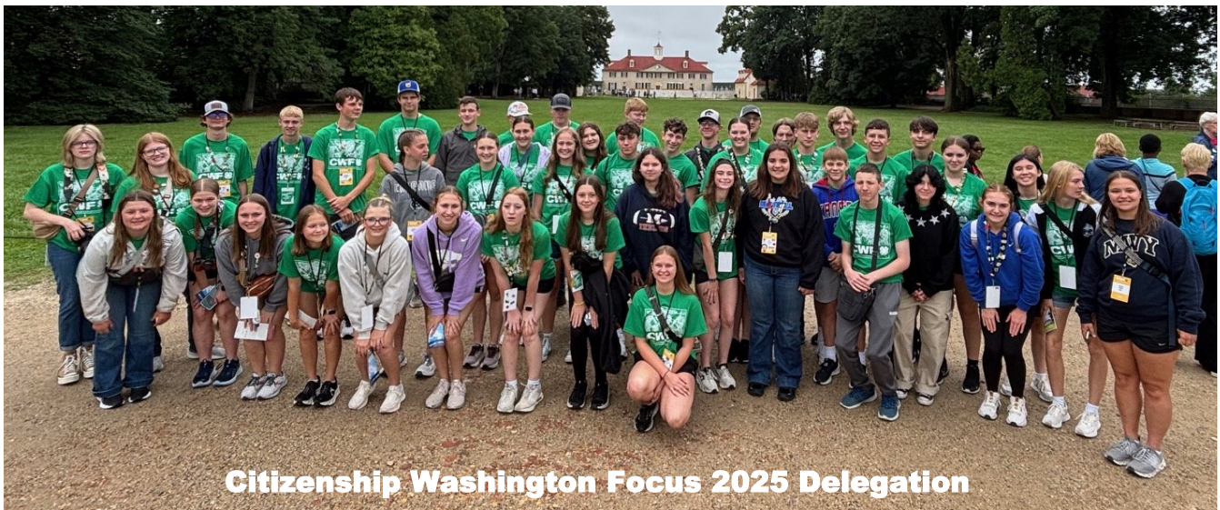
Citizenship Washington Focus 2025 Delegation