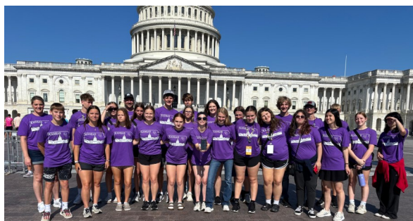
2025 CWF Delegation in front of Capitola Building