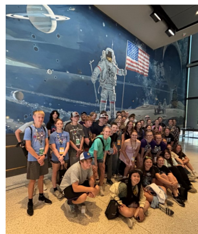
2025 CWF Delegation at Air and Space