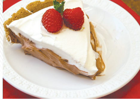
Chocolate Mousse Pie